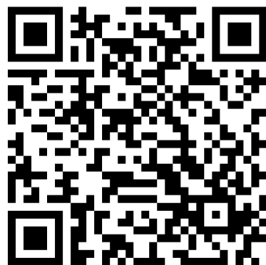
iWatchTX iOS App

Can report anonymously using any of these three options